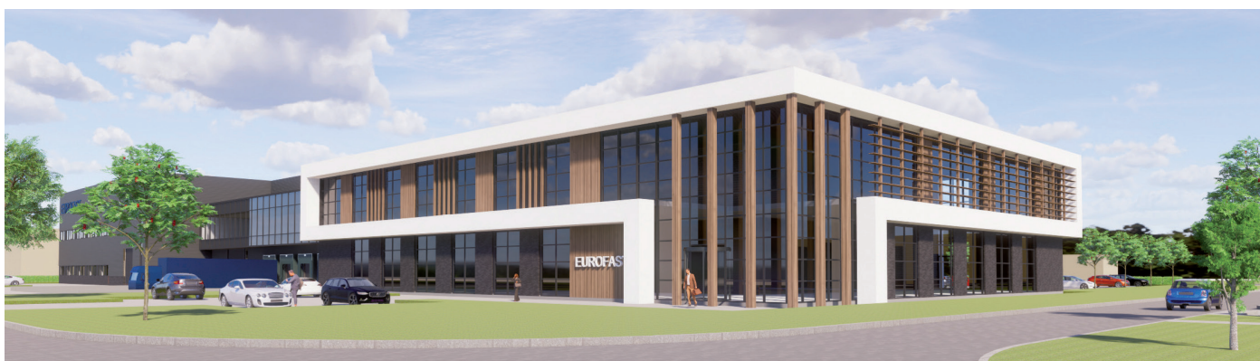
Figure 1: The view of VAN ROIJ FASTENERS EUROPE B.V. manufactory